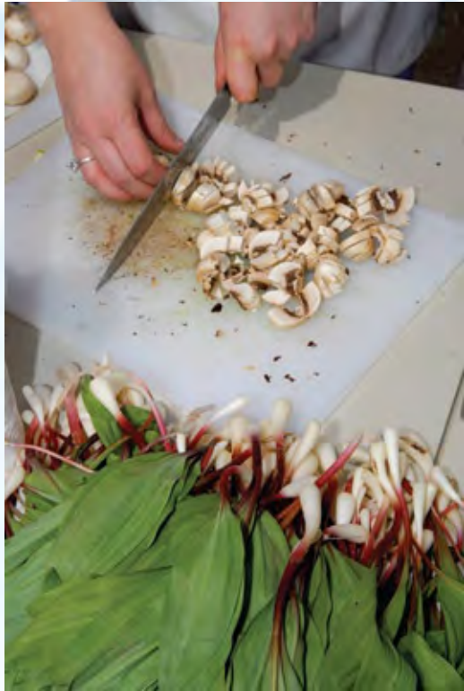
A chef dices freshly harvested ramps for one of many ramp festivals found across the state.