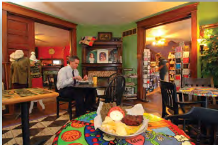
A guest of Barista's Café in New Martinsville enjoys a homemade dish and refreshing drink.

The most delicious part of any West Virginia fair or festival is the food. From time-honored favorites such as corn dogs, funnel cakes and roasted corn-on-the-cob to unique fare like buckwheat pancakes, ramps and pepperoni rolls, West Virginia offers a menu of festivals that will have you waiting in line for second helpings. For a schedule of fairs and festivals and for more information, visit the West Virginia Association of Fairs and Festivals Web site at www.wvfairsandfestivals.org .