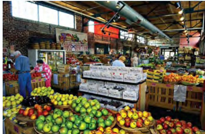
Located at the Capitol Market in Charleston, The Purple Onion offers a fresh selection of produce and other natural treats.