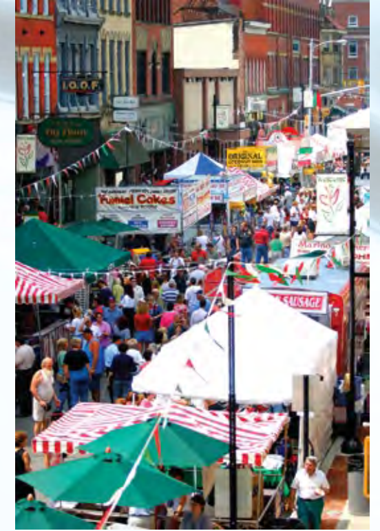
A crowd fills Clarksburg's West Main Street to sample the cuisine at the annual Italian Heritage Festival.