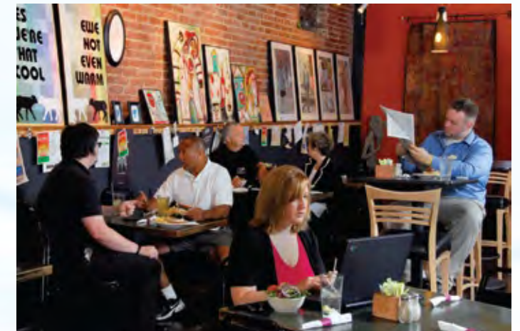
Patrons to Charleston's Bluegrass Kitchen enjoy a relaxing meal in the midst of a busy day.

Fine wine and West Virginia. This combination may sound surprising to some, but the art of wine making is taking place all over the Mountain State. West Virginia presents a collection of wineries including Potomac Highland, Forks of the Cheat, Daniel Vineyards, Mountaineer, Lambert Vintage Wines and West-Whitehill. Each has its own distinctive blend of vineyards, wines and styles.